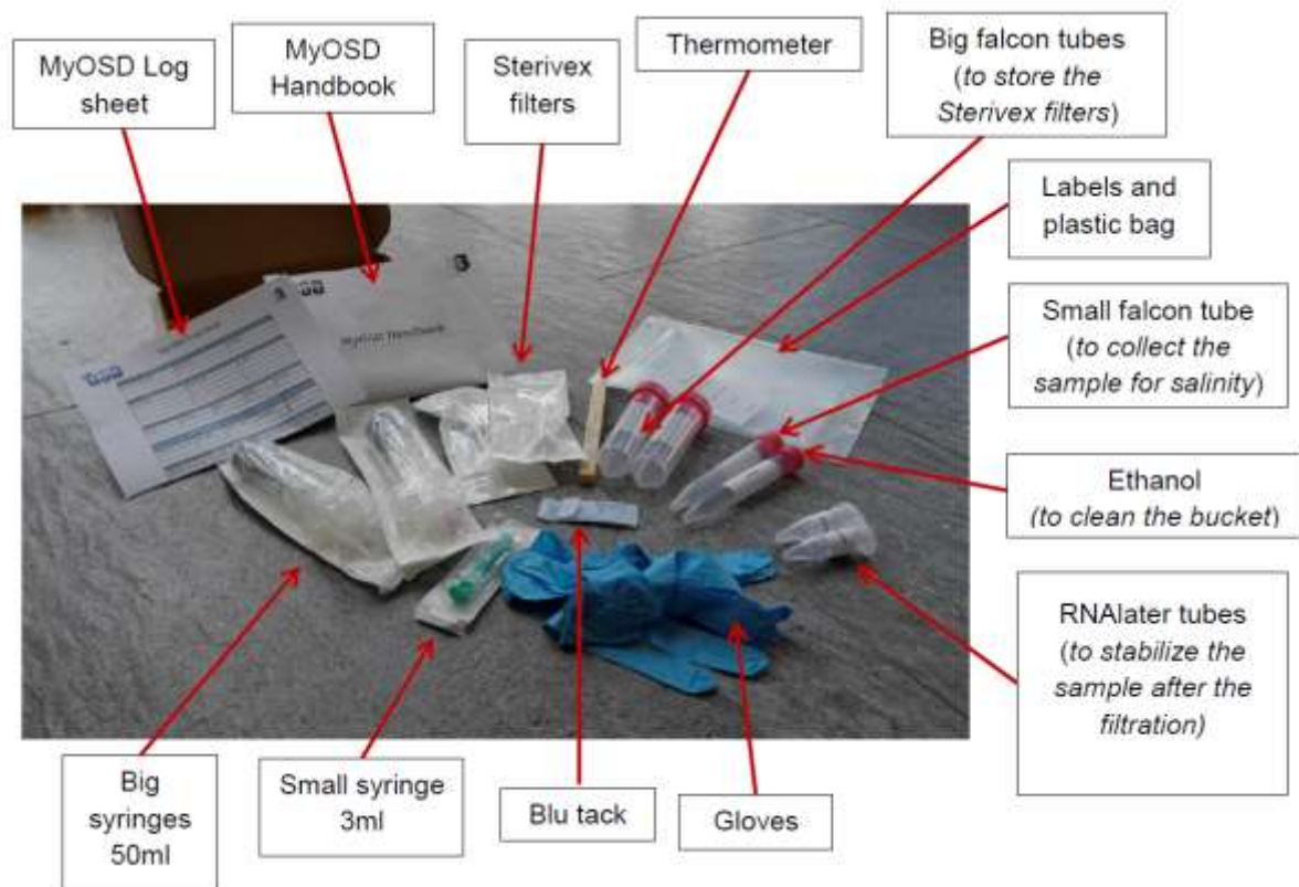
Figure 3: The MyOSD 2015 sampling kit.